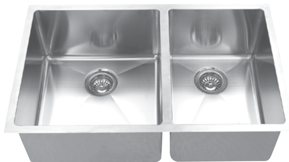
RD3319CC 16 GAUGE 10MM RADIUS 33 X 19 DOUBLE SINK