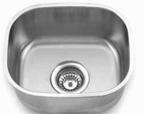
B1512 18 GAUGE 3/4 RADIUS BAR SINK

This model will fit into a 18" cabinet or wider