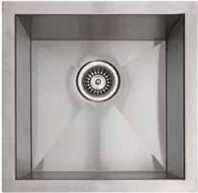
ES1717 16 GAUGE 17" X 17" x 10" SINGLE SINK ZERO RADIUS - COMMERCIAL GRADE