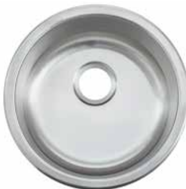
BR18 18" ROUND (8" DEEP) BAR SINK

This model will fit into a 21" cabinet or wider