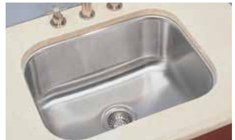
SP-3 16 GAUGE RECTANGLE SINK (9" DEEP) 18 Gauge Option : S-3

This model will fit into a 27" cabinet or wider.