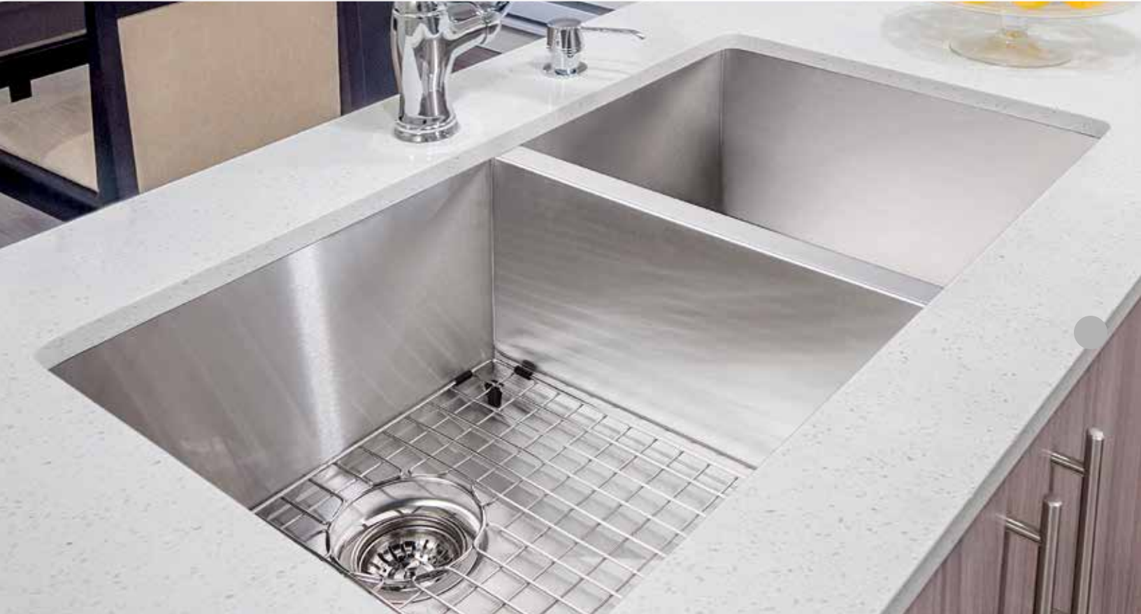
ABOVE : ED3320 16 GAUGE DOUBLE SINK ZERO RADIUS