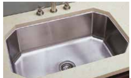
S-17 18 GAUGE LARGE SINGLE HEXAGONAL SINK (10" DEEP )

This model will fit into a 33" cabinet or wider.