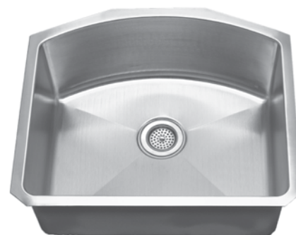
A-1C ATLAS D-SHAPE SINGLE SINK