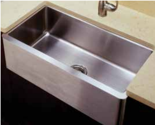
LF30 FARMHOUSE SINK