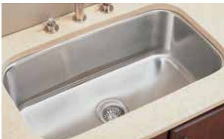
SP-14 16 GAUGE LARGE SINGLE RECTANGLE SINK (10" DEEP)

This model will fit into a 36" cabinet or wider