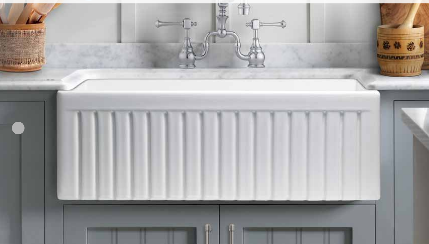
ABOVE : SP30 ( decorative side shown )

A COLLECTION OF FINE FIRE CLAY KITCHEN SINKS The little details make a big difference