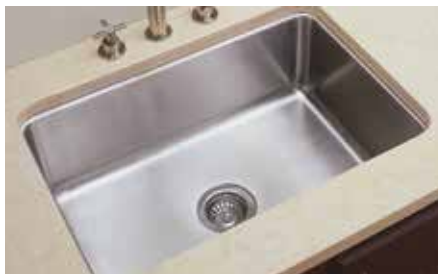
S-16 18 GAUGE SINGLE RECTANGLE SINK (9" DEEP )

This model will fit into a 30" cabinet or wider.