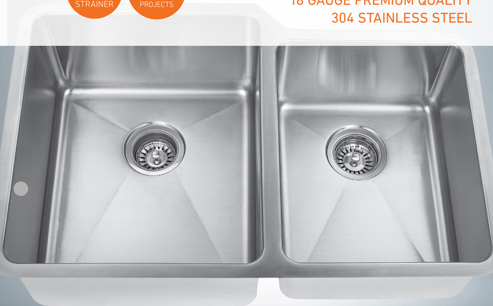
ABOVE : A-15LC