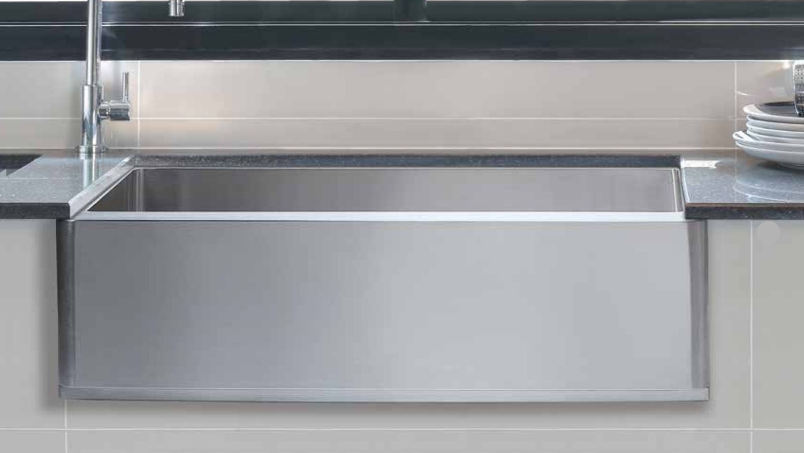
ABOVE : LX33CC EXTRA DEEP LOFT SINK NEW!